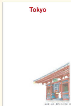
Local version (sale limited to a specific region)